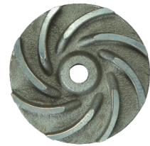
Impeller made of stainless steel