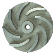
Impeller made of stainless steel